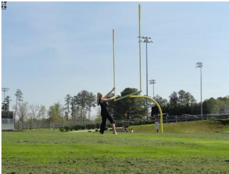
a little more to the left.