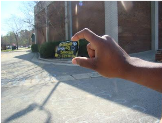
How did they spray paint on such a tiny rock?