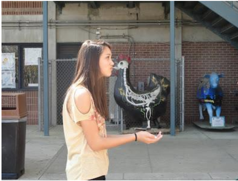
No frogs around. Maybe this chicken is a prince?