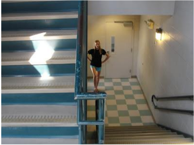
Big stairs, little people. Hey, get off the railing!